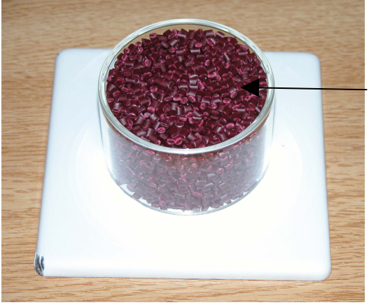
The glass bottom of the sample cup