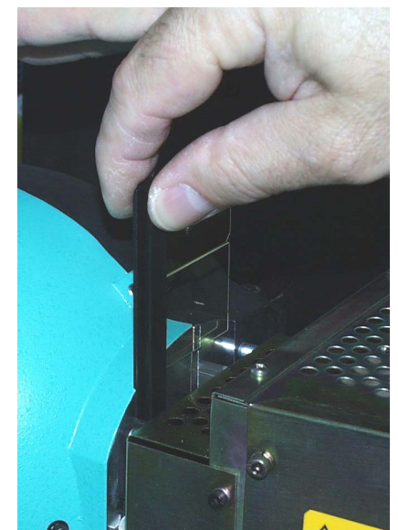
The UV filter assembly of an UltraScan XE. Note the two separate filters, above and below.

The ColorQuest XE and UltraScan XE each contain two UV filters for controlling the UV content of the source lamp, a 460 nm cut-off filter and a 420-nm cutoff filter. The 460-nm filter is placed in the light path to reduce the source light to the degree that the internal transmission is only 50% at 460 nm or is left out of the light path for no effect on the light. It is the 420-nm filter that is used for UV control, and it can be fully in the light path, partially in the light path (calibrated), or in the position set at the factory that approximates daylight (nominal). The LabScan XE contains a 380-nm UV control filter and a 420-nm UV cutoff filter that operate primarily as a pair. The 420-nm filter may be placed in or out of the light path by itself, or the two filters may be controlled together using the nominal and calibrated UV choices. The SpectraProbe XE employs a single 420-nm filter for UV control and the UltraScan PRO and UltraScan VIS use a single 400-nm filter.