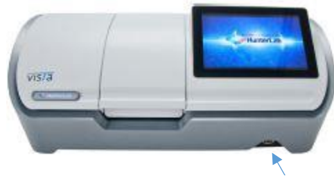
Flash drive port