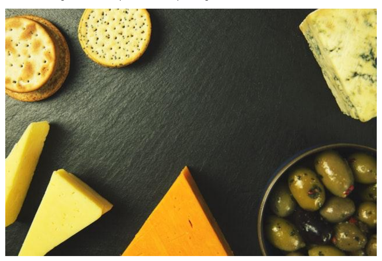
Manufacturers of everything from snack foods to cereal to cheese are moving away from artificial dyes toward natural alternatives.

Of course, replacing artificial dyes with natural colorants doesn't happen overnight. "Eliminating all artificial colors from our human food portfolio is a massive undertaking, and one that will take time and hard work to accomplish," Reid notes. While customers want artificial dyes removed, they also want their favorite foods to maintain their appearance and food manufacturers must find natural colorants that mimic the hues consumers are accustomed to. This can be challenging, as natural colorants tend to be more expensive and less stable than their synthetic counterparts. Additionally, some natural dyes impart unwanted flavors on foods, making them aesthetically useful but practically unsuitable for inclusion in recipes. As such, making the switch to natural colorants is a time-consuming and laborious process that requires significant resources.