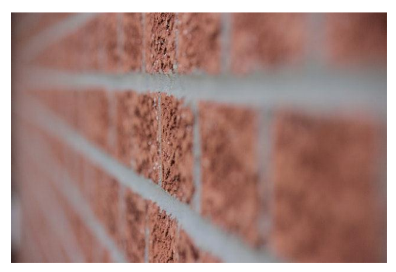
Spectrophotometers allow for the highest level of brick color quality control.

Spectrophotometers Ensure Brick Batch Quality Control